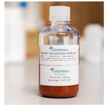
Glantreo SeNP product